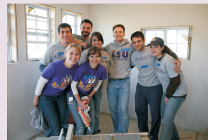
At the MTV house

Twenty of our medical students got an early start on inauguration day, swinging hammers, hanging Sheetrock, insulating, and operating power tools as they worked to rebuild two houses lost to Katrina. Part of the St. Bernard Project's 24-Hour "Rebuild the Dream" build, they started at 4:00 a.m.