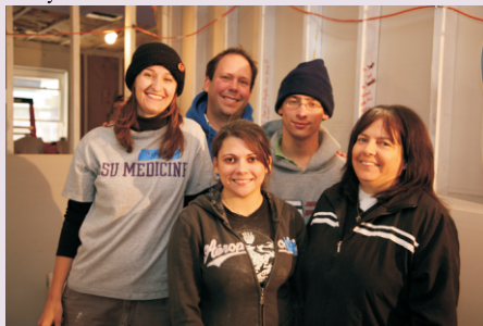
With the homeowners

It was one of the three service projects to be featured on the "Be the Change: Live from the Inaugural" MTV special that night and students were interviewed live at both houses on WWL-TV and WVUE-TV.