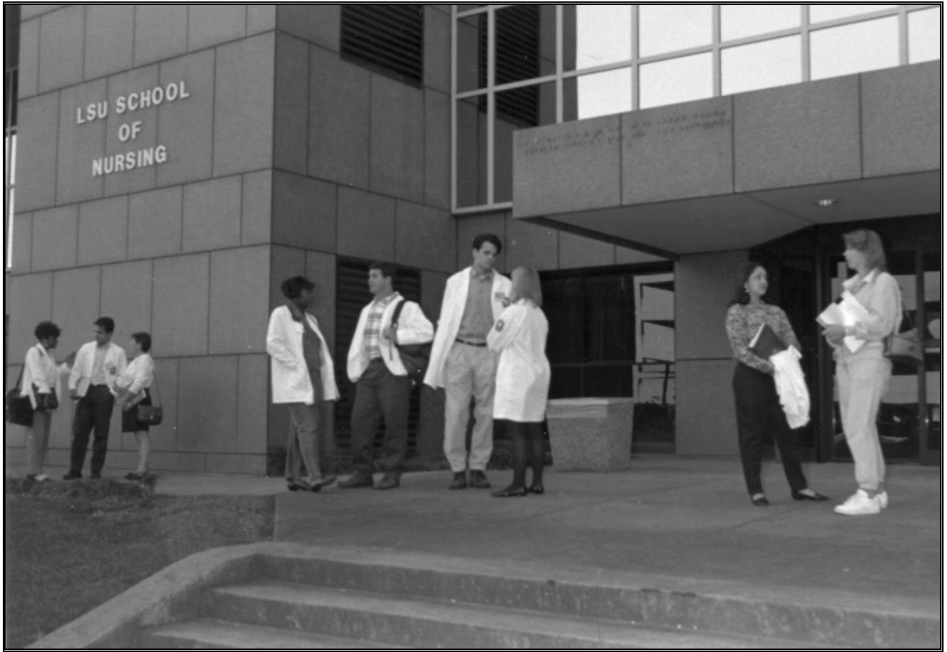
Louisiana State University Health Sciences Center School of Nursing, New Orleans