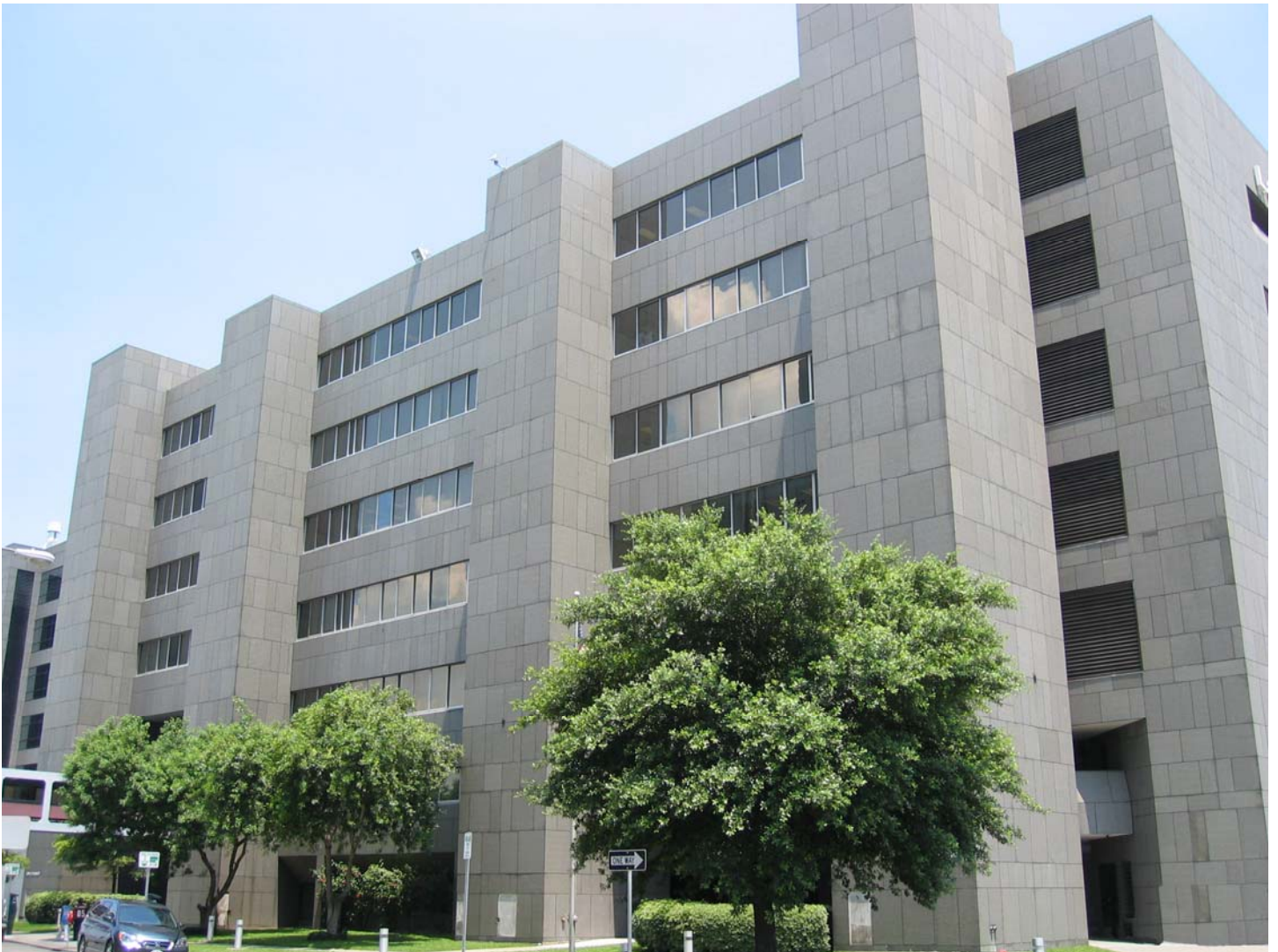
LSU Health Sciences Center in New Orleans School of Graduate Studies