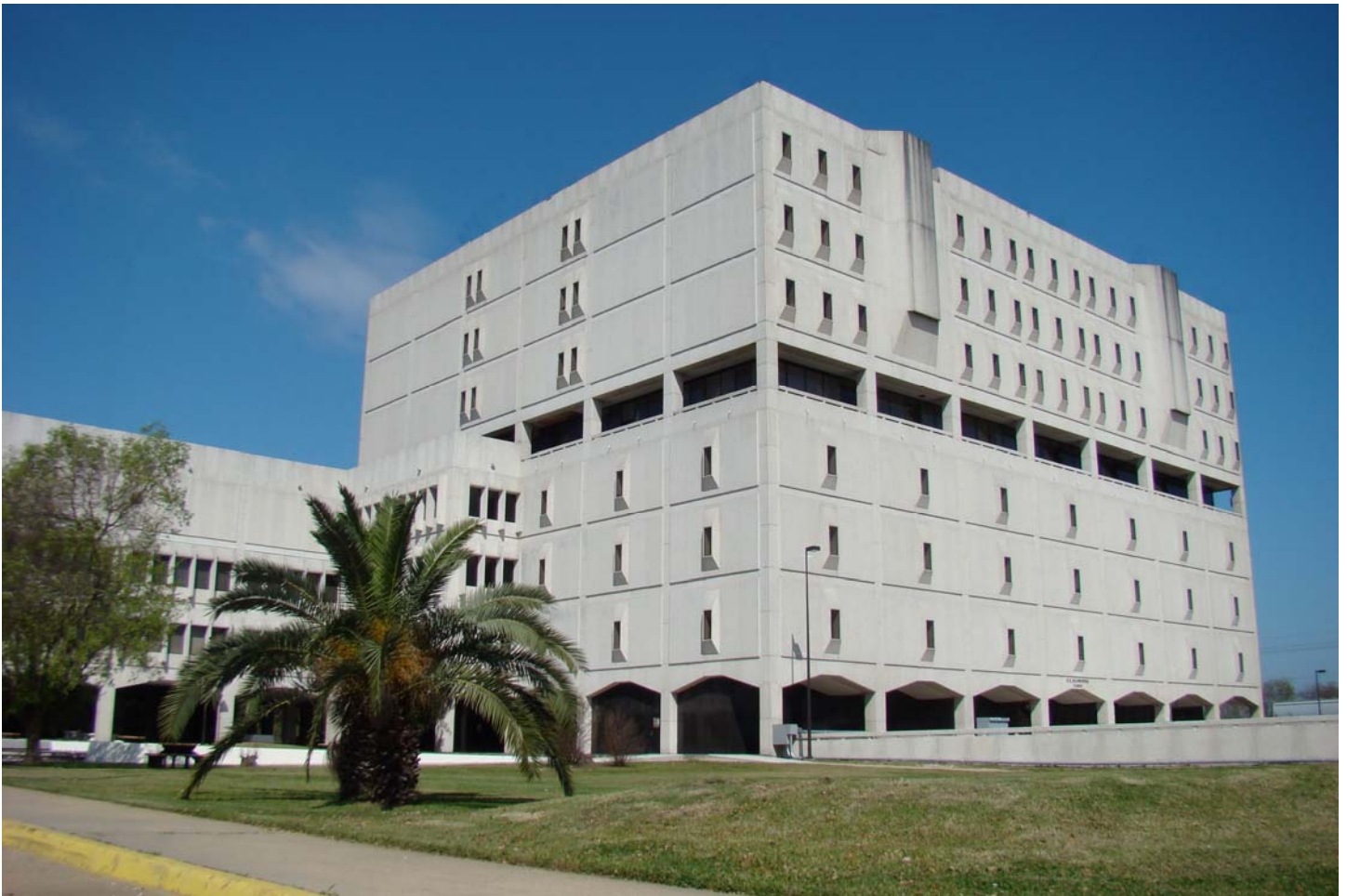
LSU Health Sciences Center in New Orleans School of Dentistry