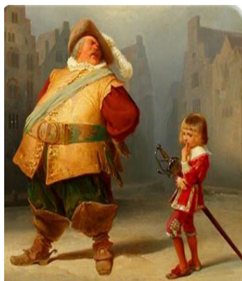
Falstaff and Prince Hal wonder whether humanistic knowledge opens career paths.