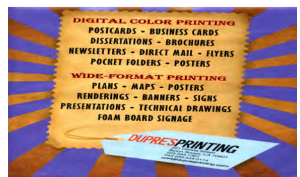
Dupree Printing Courtesy Bag