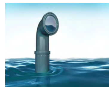
Low profile strategy does not conceal Water Campus Problems.