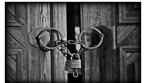
Faculty Entrance, Board of Regents search firm selection room.

In the same meeting, the Board of Regents approved the use of $12,000,000.00 putatively private money to build a great Temple of Fundraising on the site of the former Alex Box Stadium. Perhaps, after the completion of that project, the Regents might get around to the provision of hot water and working fixtures in academic buildings.