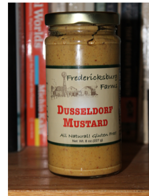
Fredrick's American-Style Duesseldorf

Earlier in this feature, modulated mustards with too many additives were cashiered from the ranks of beaten brassica beads. Admittedly, however, there is an honorable tradition of mustards in which minuscule additions of assorted aromatics yields a product that is greater and more useful than the sum of its components. Without question, the chief among these modulated mustards is the world-renowned Düsseldorf mustard, in which an admixture of carefully curated horseradish extends the rush of mustard flavor into a full-fledged gallop. Whereas an overproduced product such as Grey Poupon can inadvertently fall into a cheap horseradish pungency, Düsseldorf mustard uses only comparatively sweet horseradish varieties that confer an undefinable but intensely pleasing (if also occasionally fiery) taste and that empower an unparalleled olfactory experience. Today, Düsseldorf mustard is available in two lineages. Purists can relish the original Düsseldorf Löwensenf (Düsseldorf Lion