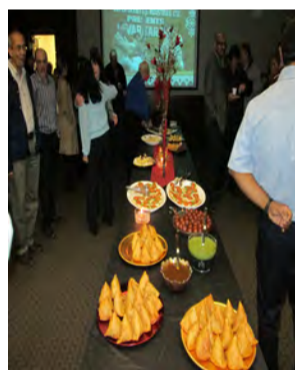
Ajmera retirement celebration conjures elegant South Asia.