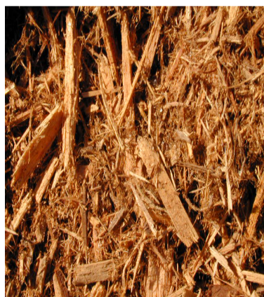
Pedestrio exits the parking structure and lands in the bagasse.