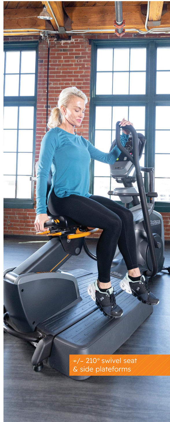
+/- 210° swivel seat & side platforms