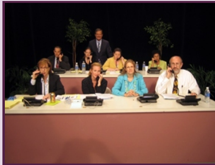
Psychiatry faculty at WDSU-TV