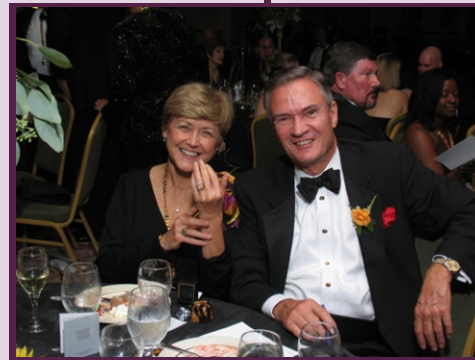
The Breaux bid won the Jubilee Diamond

The School of Medicine’s Diamond Jubilee Gala held last Saturday was an enormous success. Nearly 500 people enjoyed the festivities including a delicious dinner and dancing. The Honorable John Breaux was the Honorary Chairman of the event billed as “The First Day of School for the Next 75 Years.”