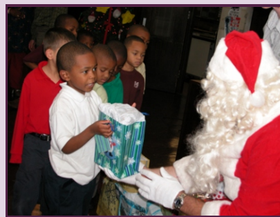
Christmas came early to Laurel Elementary