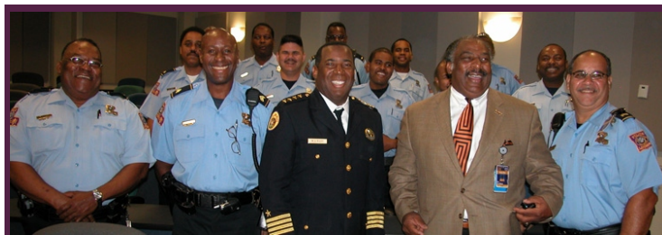
LSUHSC police officers were commissioned by NOPD yesterday extending their policing powers and increasing their ability to keep us safe.