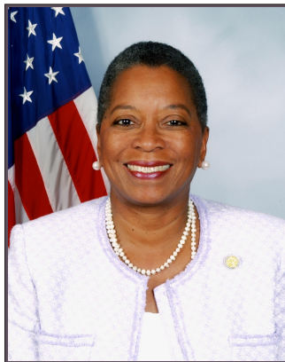
The Honorable Donna Christensen, MD

The Honorable Donna M. Christensen, MD, the first female physician in the history of the U.S. Congress, the first woman to represent an offshore Territory, and the first woman Delegate from the United States Virgin Islands, will deliver the Commencement Address at the 135th Commencement of LSU Health Sciences Center