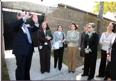
at the site of the new University Medical Center

Legislative staffers from the House and Senate Health and Welfare, Education, and Appropriation Committees visited our campus this week, spending a full day learning about us and our partnerships.