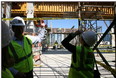
at the LCRC construction site

After an overview, the group toured the site of the new University Academic Medical Center, the New Orleans BioInnovation Center, and the new Louisiana Cancer Research Center.