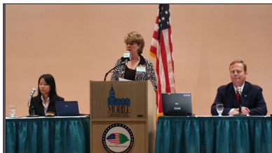
Summit in Mobile, AL.