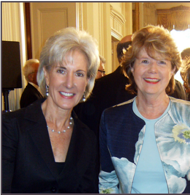
With HHS Secretary Kathleen Sebelius (l)