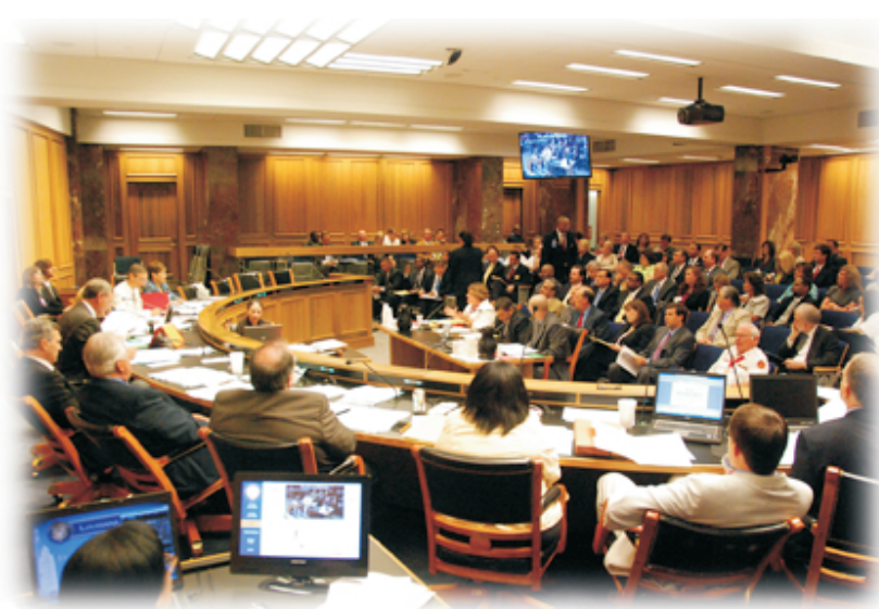
Testifying at the Legislature

the guidance of a preceptor. This fieldwork may include, but is not limited to: community education, health promotion, program planning, program organization or management and/or grant writing. ■