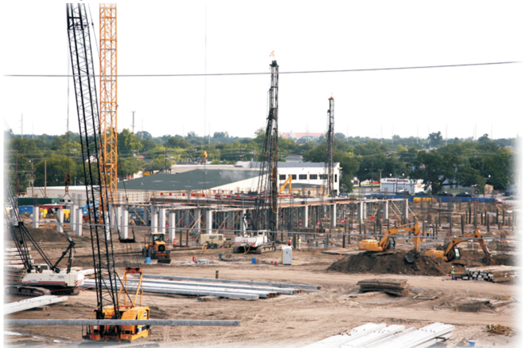
June 22, 2012

Construction on the University Medical Center is moving along with changes on the site visible from week to week.