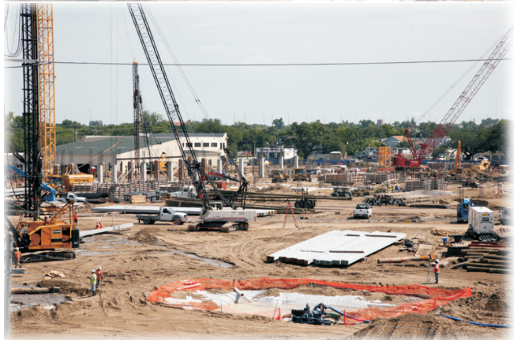
June 15, 2012

The structure of the Diagnostic and Treatment Building is underway, as is work on the Inpatient Towers 1, 2 and 3, and the Elevated ER Deck. Precast pile driving has commenced for the Ambulatory Care Building and the Elevated Garage. The hospital is on track to open in 2015.