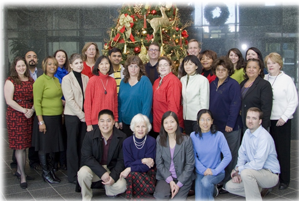
LSUHSC Louisiana Tumor Registry Staff

The Surveillance Epidemiology and End Results (SEER) Program of the National Institutes of Health's National Cancer Institute awarded the Louisiana Tumor Registry at the LSU Health Sciences Center New Orleans