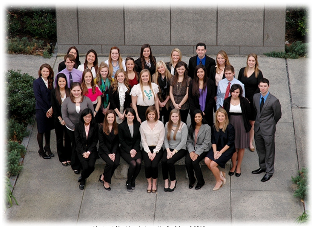
Master of Physician Assistant Studies Class of 2015

anuary 9, 2013 marked the start of classes for students in the newest degree program at LSU Health Sciences Center New Orleans. The inaugural class of the Master of Physician Assistant Program at LSU Health Sciences Center New Orleans' School of Allied Health Professions consists of 30 students.