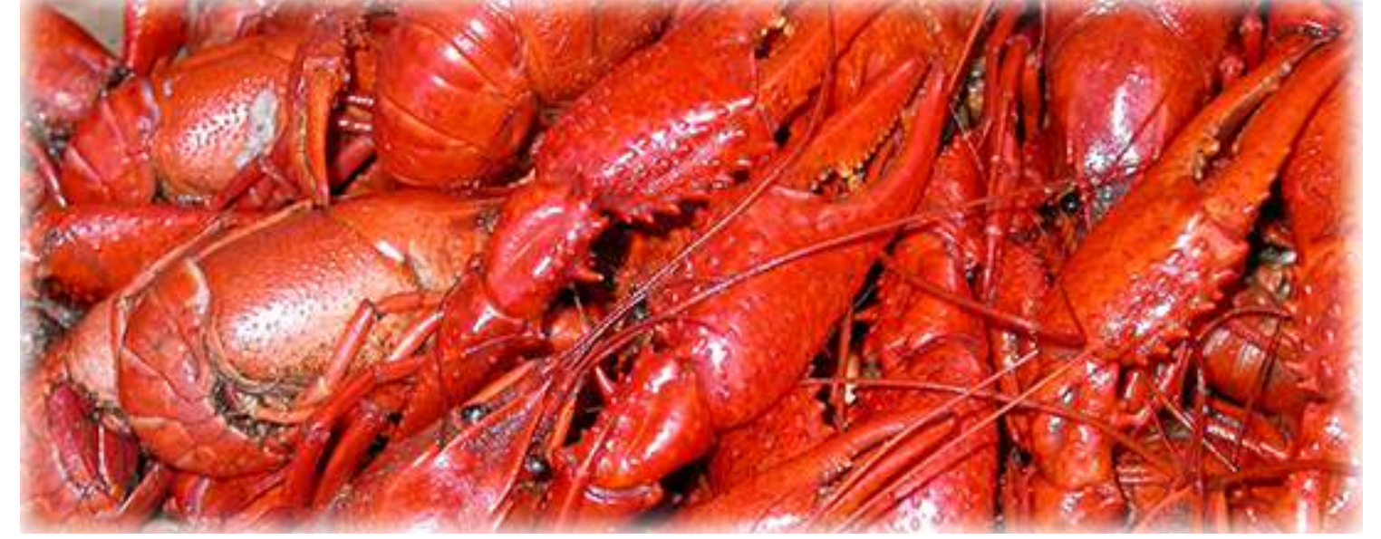
Dr. Diaz hopes to raise the index of suspicion among medical professionals so non-traditional patients and those not exhibiting all symptoms but who are at risk can be diagnosed and treated to avoid potentially life-threatening lung or brain complications.