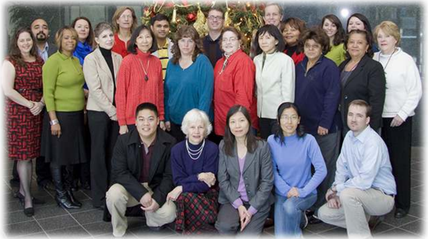
Staff of LSUHSC's Louisiana Tumor Registry

The LSU Health Sciences Center New Orleans School of Public Health's Louisiana Tumor Registry (LTR) has been awarded a $1.3 million contract by the National Cancer Institute to continue its work as a SEER (Surveillance, Epidemiology and End Results) Program-designated cancer registry. There are 18 competitively awarded SEER cancer registries in the United States. The SEER Program is the most authoritative source of information on cancer incidence and survival in the country. Continued designation recognizes the excellence of our Louisiana Tumor Registry and confirms the exceptionally high quality of its data.