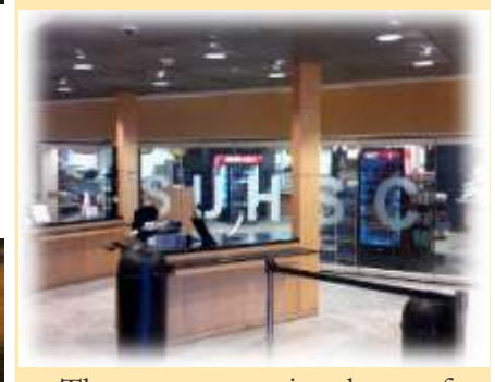
The new operating hours for Monday through Friday are: Tiger Den Café: 7:00am – 2:00pm Dental Café: 7:30am – 1:30pm Atrium Coffee Kiosk: 7:00am -4:00pm

eginning Tuesday, January 21, 2014, LSUHSC is excited to announce that we will assume operations for all dining services including the Tiger Den Café in the MEB, the Dental School Café, the Atrium Coffee Kiosk, and Campus Catering. You will start to notice many positive transformations as we ramp up services with quality, customer service, healthier options, variety and value at the forefront.