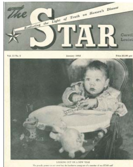
A cover of The Star from January 1952 reads "LOOKING OUT ON A NEW YEAR We proudly present as our cover boy the handsome young son of a member of our STAR staff". Patients and Staff at the Carville Hospital had close relationships, and often celebrated Christmas, Mardi Gras, weddings and other events together.

Contradicting the misinformation about leprosy was needed. In the 1890's, residents of New Orleans were terrified to learn that a treatment center for leprosy could be located in their city, so a more isolated location was selected. Even in the isolated setting, the lease of a plantation in Carville was done under the pretense that it was going to be an ostrich farm 2 .