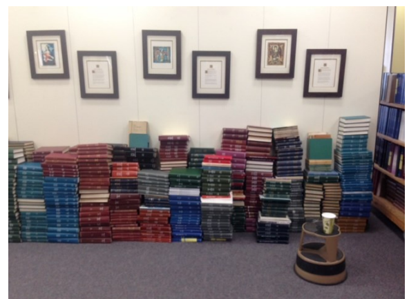
Books were stacked on any available surface while the repairs were underway.