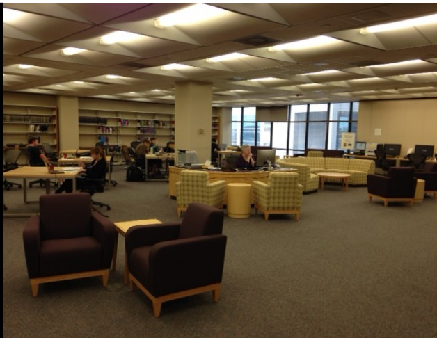
The Reference Desk and study area on the third floor of the Isché Library.